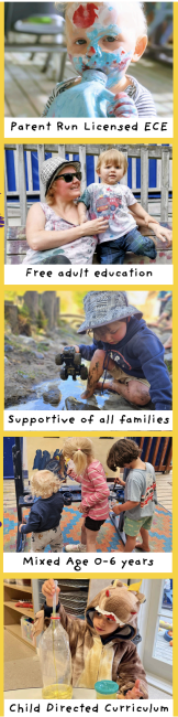
Parent Run Licensed ECE